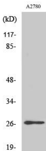
Western Blot analysis of various cells using Phospho-p27 (S10) Polyclonal Antibody